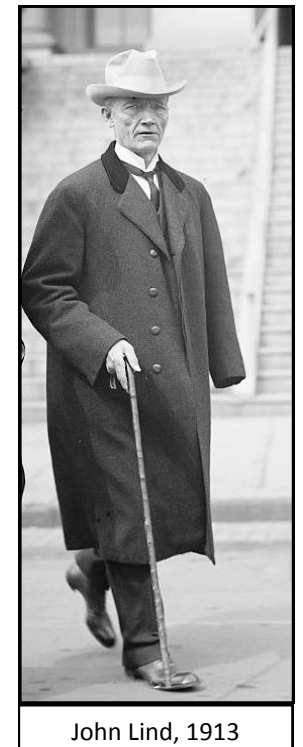
John Lind, 1913

Sign on Sibley County Rd. 8, Section 28, commemorating the boyhood home of John Lind, 14th Governor of