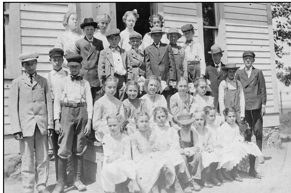
Notice how dressed up they all are. The boys have hats or caps, only two with bib overalls, all the girls have dresses.